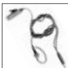
BDN6667 (Biege) 2-wire surveillance