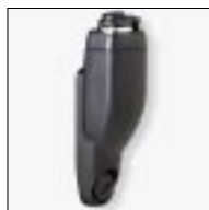
PMLN4455 Accessory Adaptor