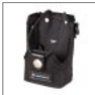
** PMLN4470 Nylon Case with Swivel Clip