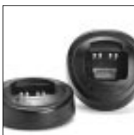
PMTN4025 Single Rapid Charger