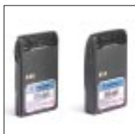
JMN4023/4024 Slim & Hicap Lilon Batteries