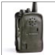
** PMLN4421 Soft Leather Case with Swivel Clip