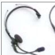
JMMN4066 Lightweight Headset with Boom Mic