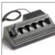
PMTN4028 Multi-Unit Rapid Charger