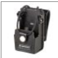
** PMLN4471 Hard Leather Case with Swivel Clip