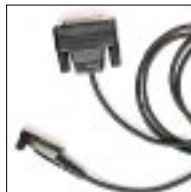
JMKN4123 Programming Cable