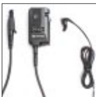
JMMN4064 VOX/PTT Interface Module shown with BDN6768 Ear Microphone