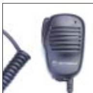
JMMN4067 Remote Speaker Mic